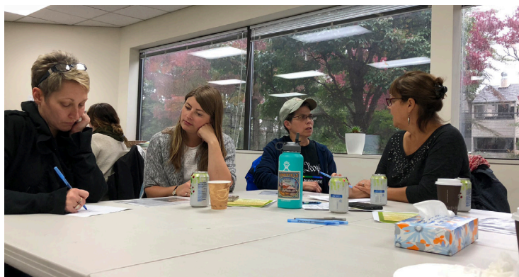
Store to Door staff at an Equity Diversity and Inclusion Training session in October.

“Store to Door is dedicated to reaching our equity goals and ensuring nourishment and connection for all seniors and adults with disabilities in need.”